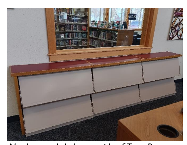
Newly moved shelves outside of Teen Room