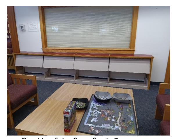
Outside of the Sage Study Room